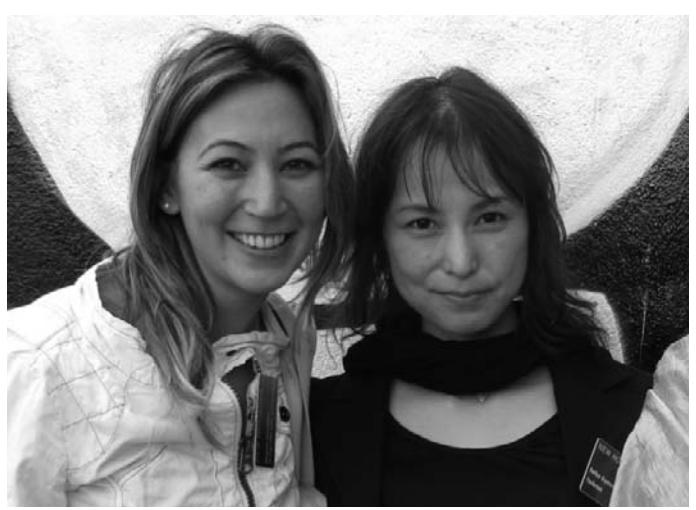
Communication filled with smiles during the conference period

It is my hopeful wish that patient support organizations all over the world will work together so that we can all face our illness with more strength, and that medical and pharmaceutical developments will further continue towards the goal of complete cure.