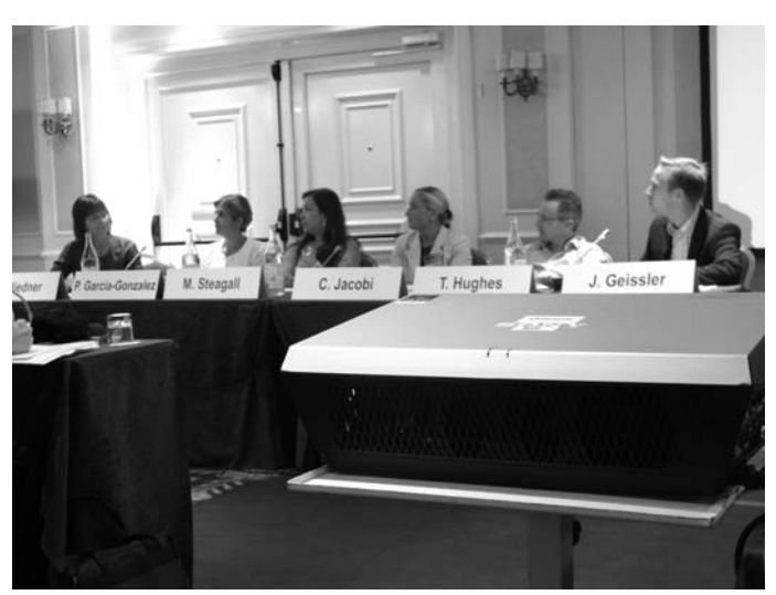
Participants discussion about building strategic alliances for CML